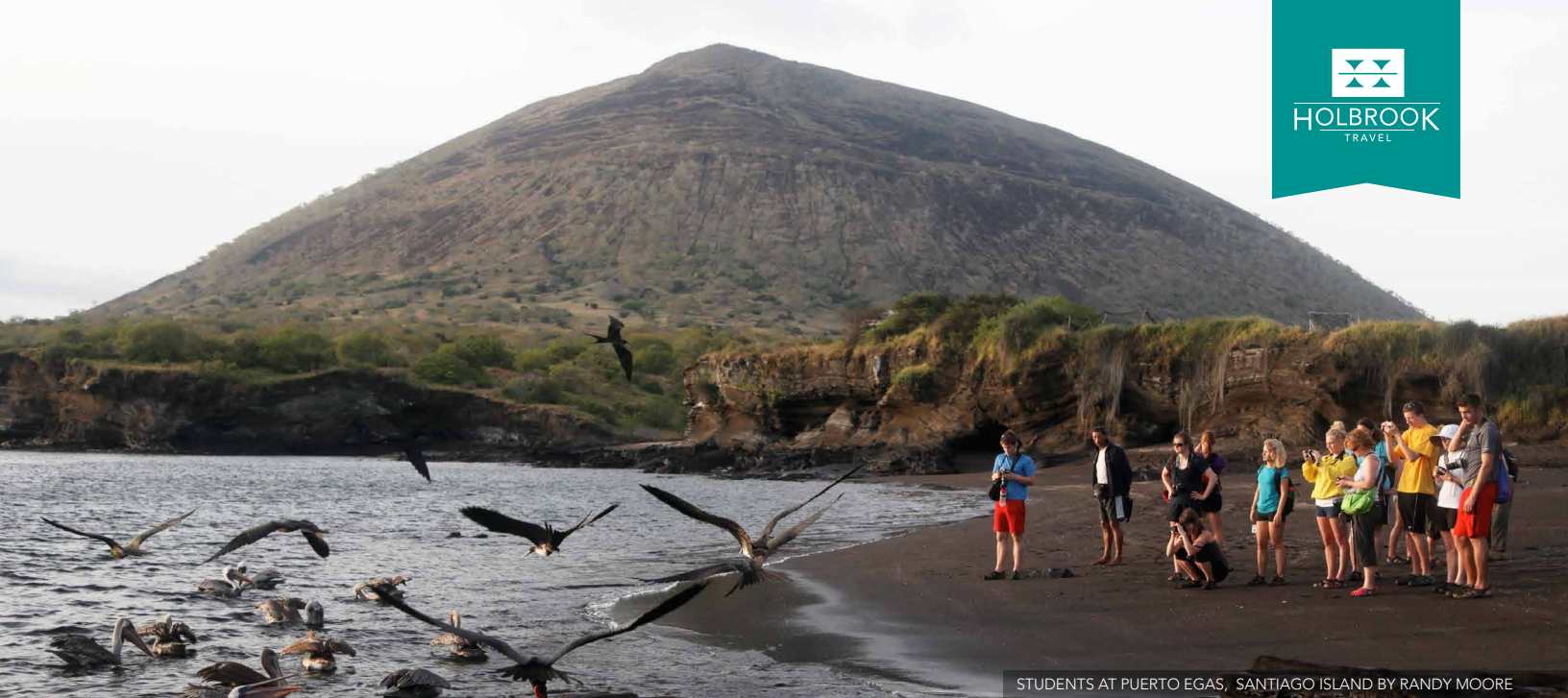
STUDENTS AT PUERTO EGAS, SANTIAGO ISLAND