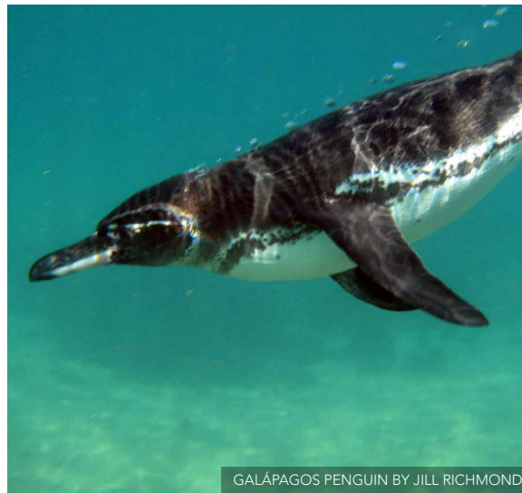
GALÁPAGOS PENGUIN BY JILL RICHMOND

Today disembark at Moreno Point near Elizabeth Bay on the west coast of Isabela Island. A plethora of birds can be seen on a dinghy ride along the rocky shores or during a hike along a path that leads through lava rocks to tide pools and mangroves. In the tide pools, green sea turtles or white-tipped reef sharks can be seen. After lunch, take a panga boat ride around Elizabeth Bay, one of the island's breeding sites for penguins. Located on the west coast of Isabela, Elizabeth Point is a marine visitor site. Also visit a red mangrove cove, where Brown Pelicans, Flightless Cormorants, spotted eagle rays, golden rays, and sea lions are often seen. Overnight aboard M/Y Bonita. (BLD)